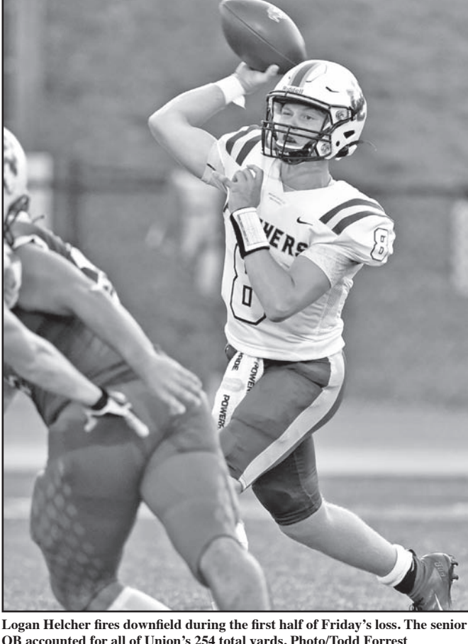
QB accounted for all of Union's 254 total yards.

Starting at the 23, the senior QB found fellow senior Keyton Chitwood for 14 yards