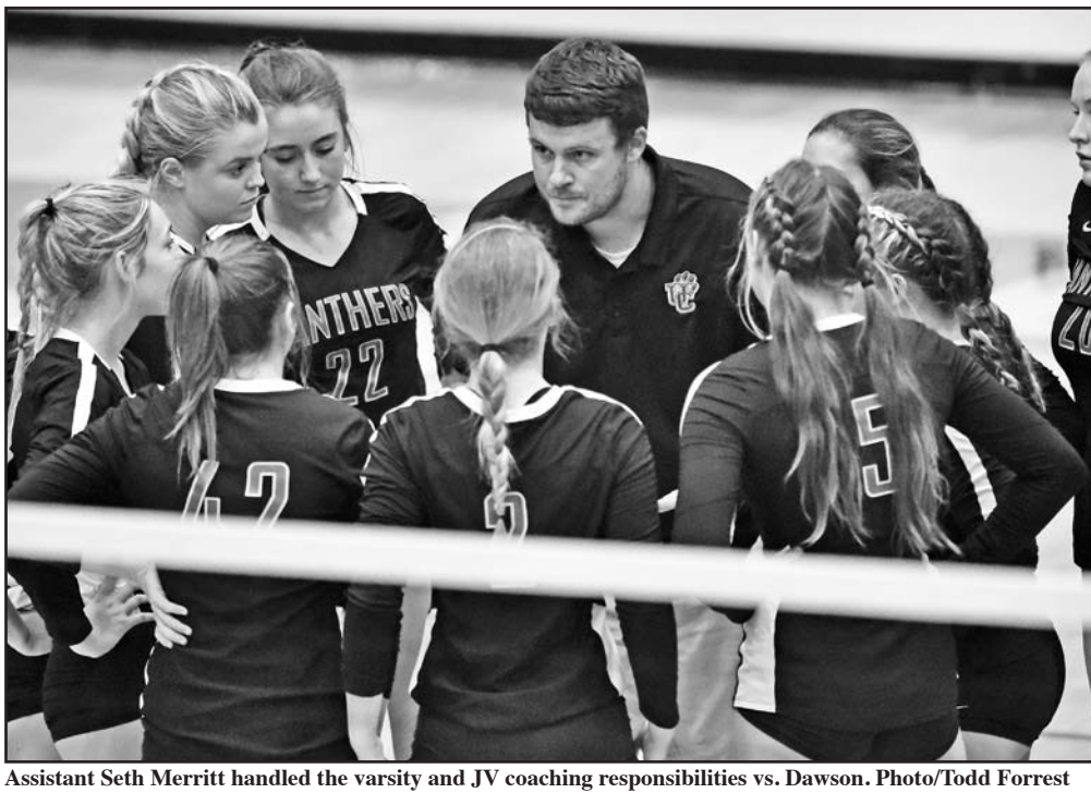
of the way. Union's last gasp came

After the stoppage, it was all Dawson County the rest of the way. The visitors rattled off a 9-0 run to build a 17-11 lead. Union pulled within 17-13 but got no closer as Dawson outscored the Panthers 8-3 the rest